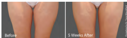
One CoolSculpting® Treatment

Contour Dermatology also offers the CoolFit applicator which can help create a more desirable “thigh gap” between the inner thighs, get rid of “jiggly arms” and reduce “bra fat.”