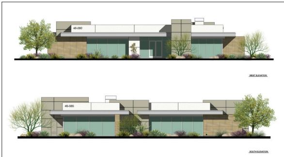
Rendering of Contour Dermatology's new La Quinta office at 46080 Jefferson Street.

"One of the things we strived for was a healthy building," said Greenwood. "A lot of attention was given to selecting materials that will promote the best possible air quality and there also is a lot of natural light."